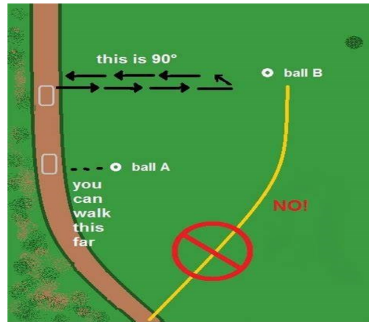
The 90 degree RULE is not a suggestion.

The cost each week to play is $50.00 in May and then $40.00 from June through October which will include 9 holes with a cart and prizes. For weekly signups, please call 772-770-5000 ex 2 or email bnagy@ircgov.com .