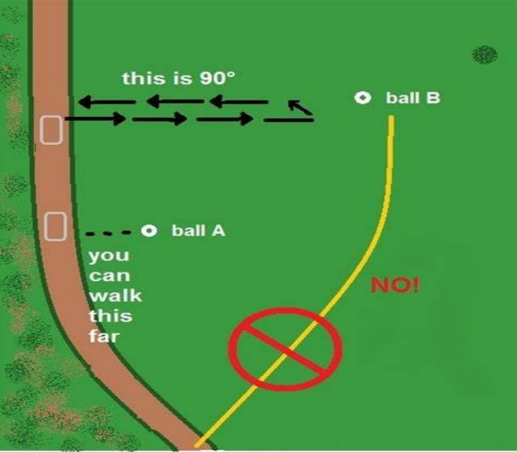
The 90 degree RULE is not a suggestion.

The cost each week to play is 40.00 through October which will include 9 holes with a cart and prizes. For weekly signups, please call 772-770-5000 ex 2 or email bnagy@ircgov.com .