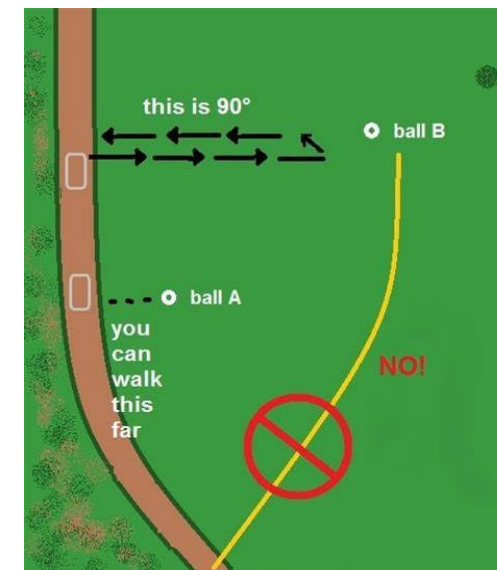
The 90 degree RULE is not a suggestion.

Fees: $25.00 per student each week for either clinic